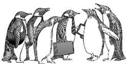
140th Annual Meeting

FCC has two long standing commitments for service to the Marshalltown community. We are responsible to furnish delivery drivers for noon Meals-On-Wheels on the 4 th & 5 th Saturdays of each month. One of our active volunteers would be available to ride with you on your initial trip if you can give 1-1½ hours to this project. The other commitment is to prepare and serve an evening meal at House of Compassion on the 1 st Monday of each month. The meal is prepared at HOC from food available there. Serving takes place from 5-6:15 p.m. This project requires cooks to prepare the meal, serve and clean up; cooking (depending on what is prepared) usually begins near 3 p.m. and those serving need to arrive 4:30-4:45 p.m. Clean up is normally finished by 7 p.m. If we could have 3-4 sets of volunteers to this project, it would mean giving 2½ - 4 hours of service every 3 rd or 4 th month. Please give your prayerful consideration to these outreach programs.