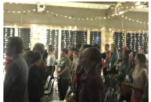
The Flamingos @ Pastor's Yard Sale at FCC