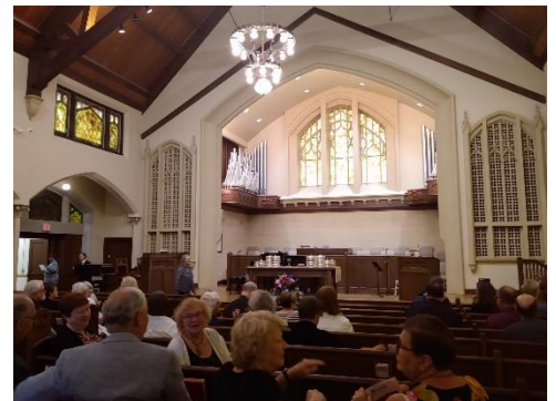
(listed above are some pictures of the event and facilities)