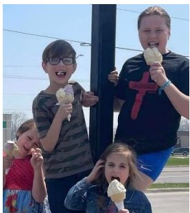
We want to celebrate the special youth God has placed in our church and so we are taking them out for birthday treats this year. Here are some of our youth with spring birthdays.

There is no Power Hour, DOG's, Jr PY or PY for June.