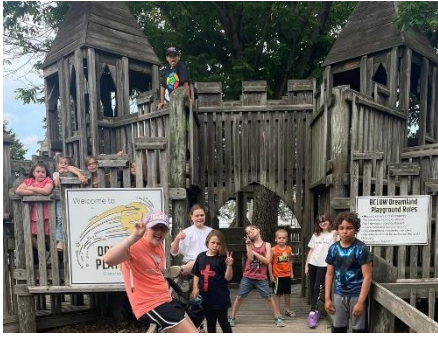
We took the DOG's group to Dreamland Park in Conrad, IA and had a picnic.