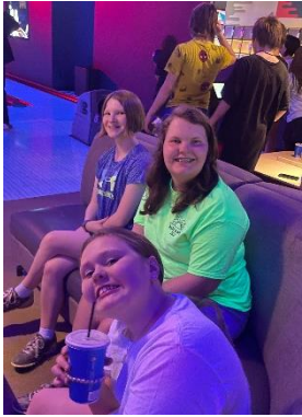
We took the Jr PY & PY groups bowling and are pizza at Wayward Social.