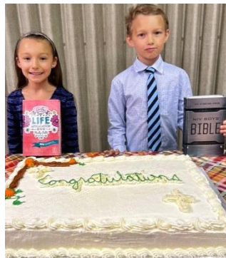
We were honored to present two 3rd graders with Bibles in October during a church service and celebrate with their family with a reception after church.

The youth groups will be putting together gift boxes the first week of November for Operation Christmas Child and praying over the children that will be receiving them. We will be collecting items to put into the boxes for the youth to pack together. We will have a box in the back of the sanctuary in the Narthex labeled Operation Christmas Child the first week of November for anyone who has items they would like to donate for our kids to bless children with. Things we can't pack are lotions, shampoos, conditioners, toothpaste, and candy. Thank you so much! This is an amazing mission through Samaritan's Purse.