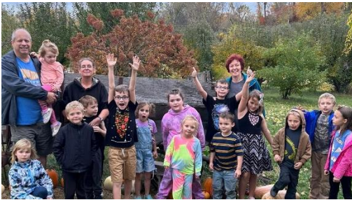
In October the DOG's group went to Appleberry Farm to pick apples and take a hayride through the orchard.

PY (Pilgrim Youth): Wednesdays 6:30-8pm with a meal for 9-12th grade November 1, 8, 15, 29 (not 22nd, Thanksgiving break)