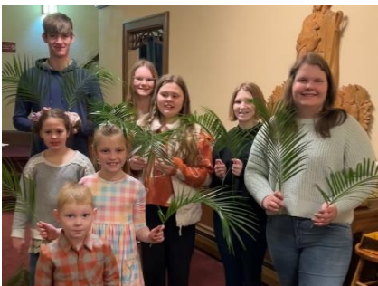
Was a wonderful Palm Sunday celebration!