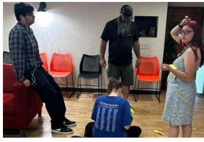
PY Wednesday nights