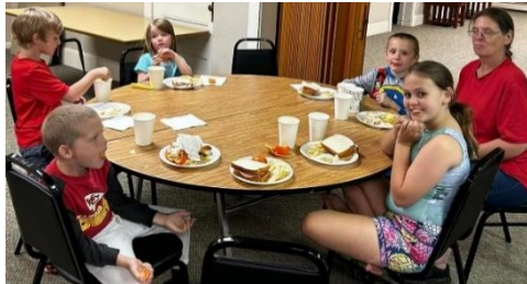
DOG's Tuesday nights