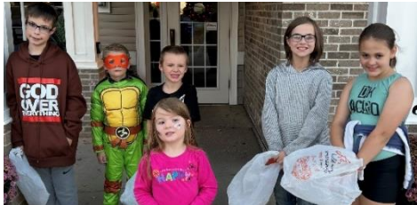
Visited Glenwood residents during their trick or treat event.

We took the Jr PY & PY groups to Center Grove Orchard in October for fun and fellowship