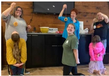
Power Hour Sunday mornings