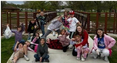
Our DOG's group picked up trash at Riverview Park as an Earth Day project in April.

Our church hosted a wonderful IA/NE Association meeting with some of our regional Congregational churches in April. It was a great time of fellowship and planning.